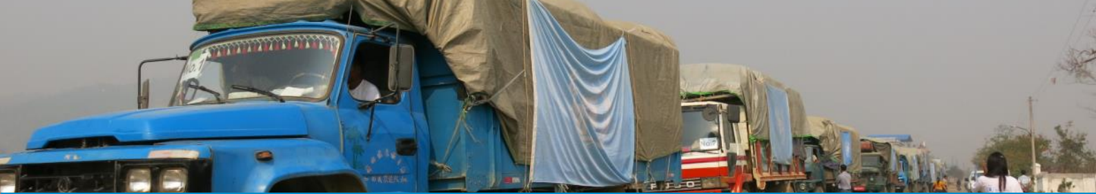
UN convoy, delivering humanitarian assistance, in Bhamo Township of Kachin State.